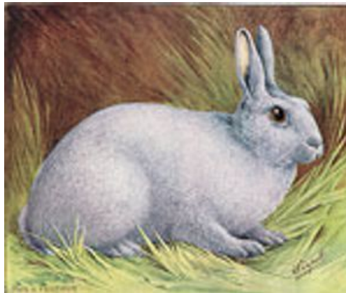
Silver Glavcot Wippell Print From Fur & Feather

late geneticist Roy Robinson said the breed could be recreated by using a steel colored rabbit as a male and breed with Blue Beveren females. Then the steel offspring from the first crossing would need to be mated back to the Blue Beveren. Silver Glavcots were a beautiful colored rabbit as painted by Wippell in the early 1920's for Fur and Feather . It appears no one knows why the breed was given the name Glavcot.